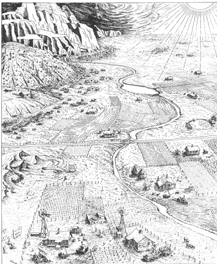
“The Great Plains of the Present.”

The original caption was, in part, “The White Man . . . came as a conqueror first of the Indian, then of Nature. . . . The plough ignores Nature’s ‘Keep Off’ signs; communities, for all the courage of their people, fall into decay.”